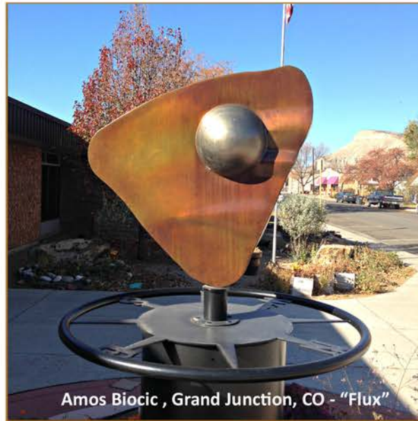
Amos Biocic , Grand Junction, CO - "Flux"

"My art is reflective of my love for the visual character and beauty of natural elements and materials." - AB