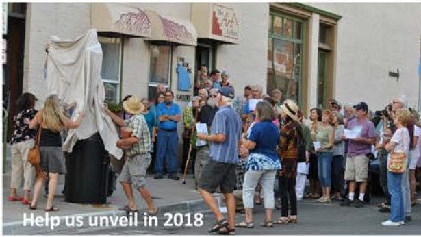
Help us unveil in 2018